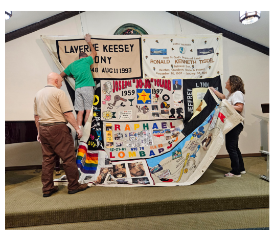
The plan goes into execution mode. A little to the left, please.