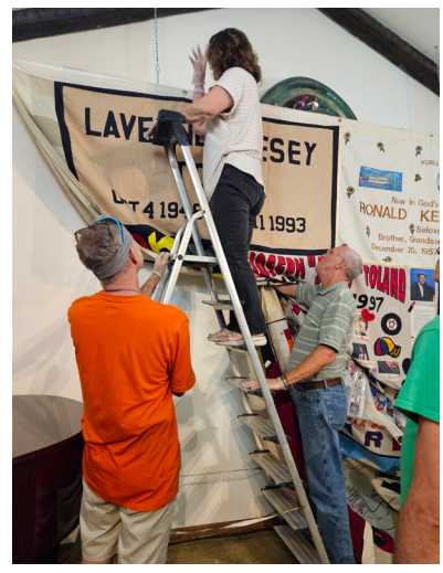
What was she thinking?! Hope the Workers Comp is paid.