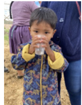
Child drinking Mamanaca well water.