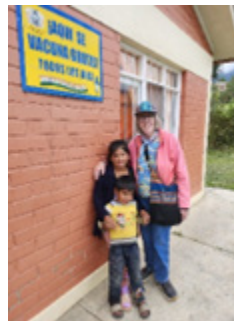
Children, US visitor, vaccination campaign - Corani Pampa

We send our best wishes to each of you. Thank you!