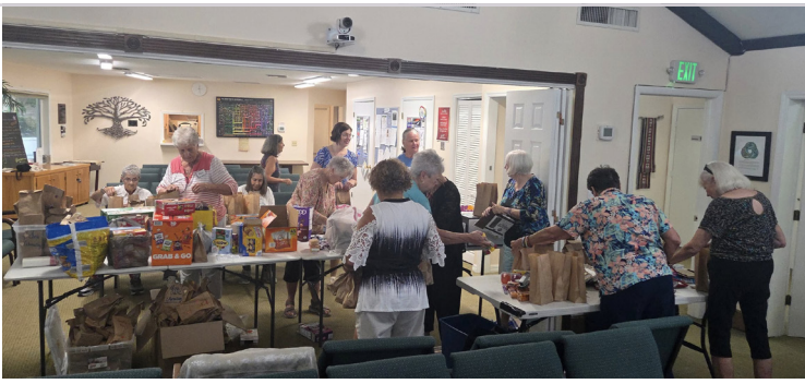
This is how we roll...assembling Hungry Hungry Kid kits for the Community Cooperative Soup Kitchen!!