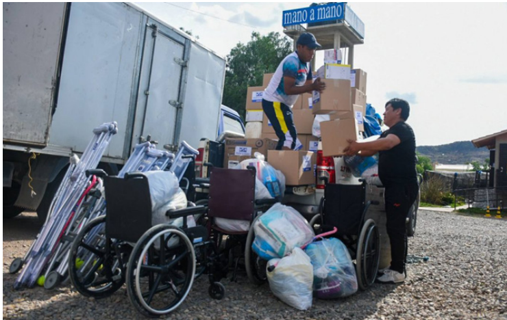
Donated items being picked up by rural Bolivians.

In fact, in a few weeks the volunteers and staff in St. Paul will be filling FIVE CONTAINERS with assorted equipment and then shipped to Bolivia.