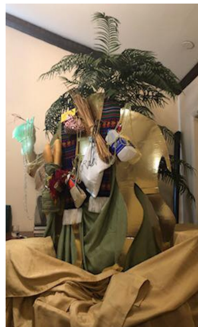
Balthazar , the camel, following the star to Bethlehem on Christmas Eve.