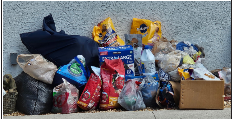
All Faiths donations from the March collection benefitting Guardians of Florida Rescue (GOFAR).

This May has a 5th Sunday which means another Animal Shelter will receive donations from All Faiths friends and members. Please consider bringing items such as dry and wet food, blankets, towels, cleaning products, pet store gift cards.